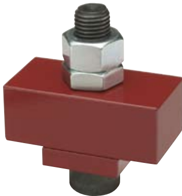
Series H20 Series H21

Series H21 heavy hex jam nuts are for use with Series H11 heavy hex nuts.